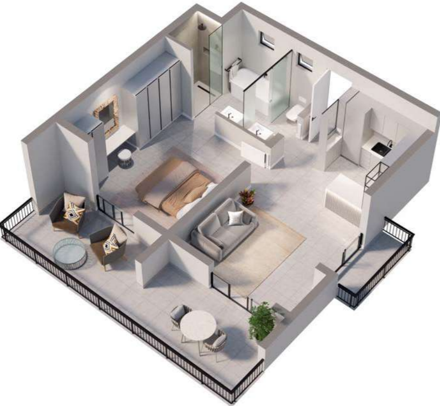
TYPE Q 1 Bedroom | 1 Bathroom | Total Area: 77m 2