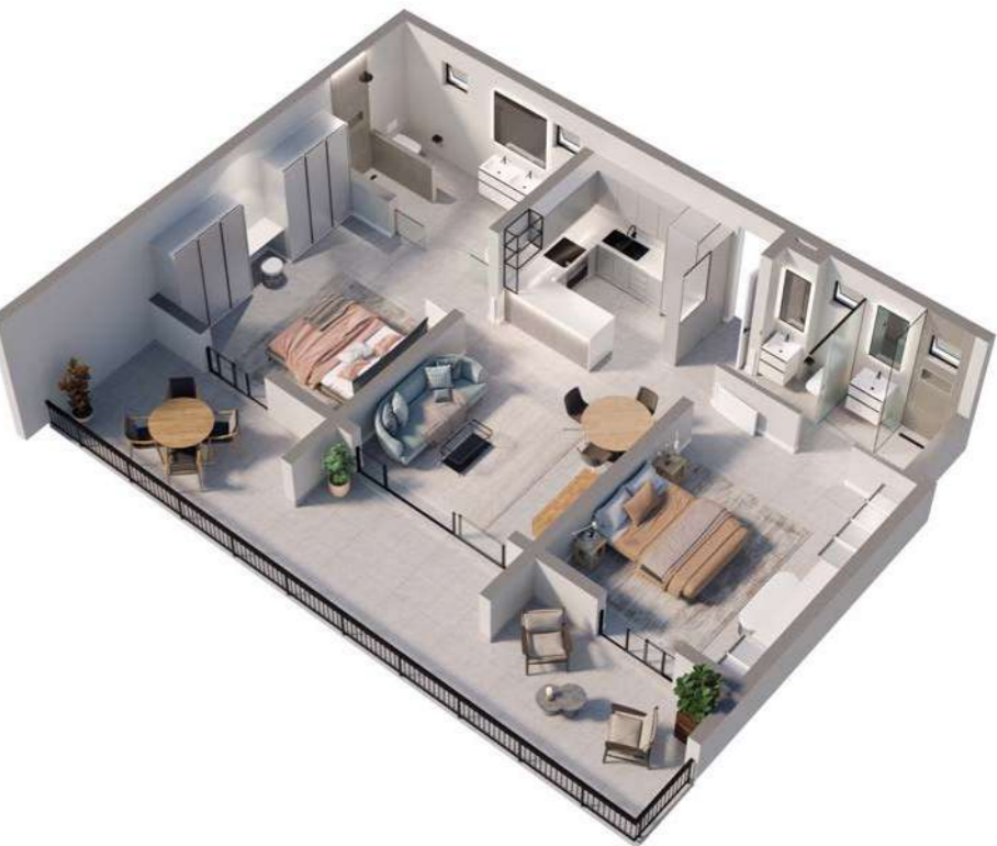
TYPE R 2 Bedrooms & 2 Bathrooms | Total Area: 117m 2