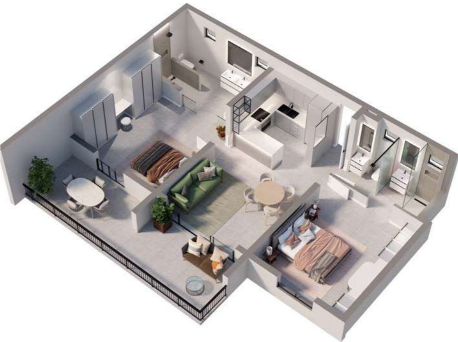
TYPE M 2 Bedrooms & 2 Bathrooms | Total Area: 107m 2