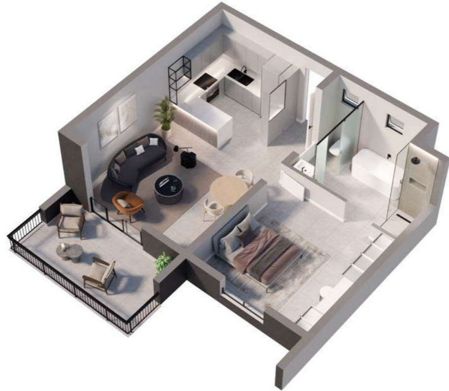
TYPE S 1 Bedroom | 1 Bathroom | Total Area: 79m 2