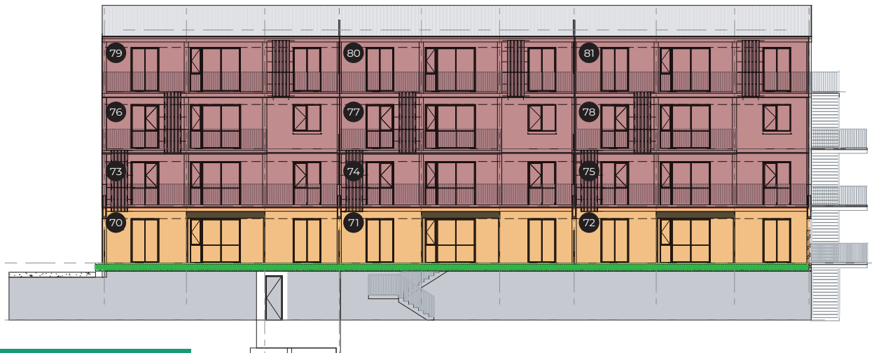
PHASE 4 | CEDAR